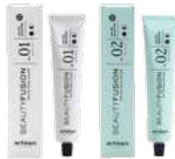
Size: 100 ml