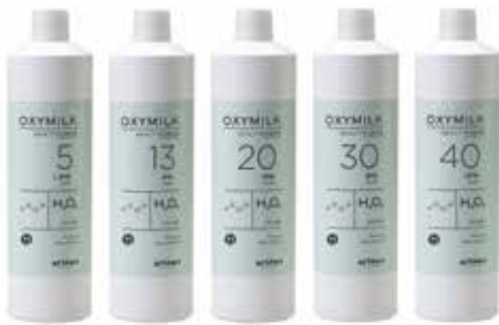
Size: 1000 ml