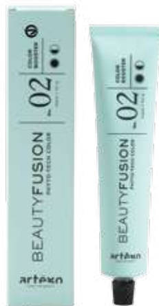
02 Levels 7 to 12