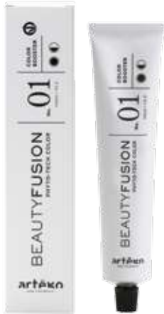
01 Levels 1 to 6