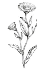
CALENDOLA Calming, hydrating