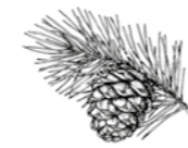
SCOTS PINE Balmy and decongestant

RICH IN DECONGESTANT AND BALMY NATURAL ELEMENTS, THEY ENSURE PERFECT EMOLLIENCY AND HYDRATION